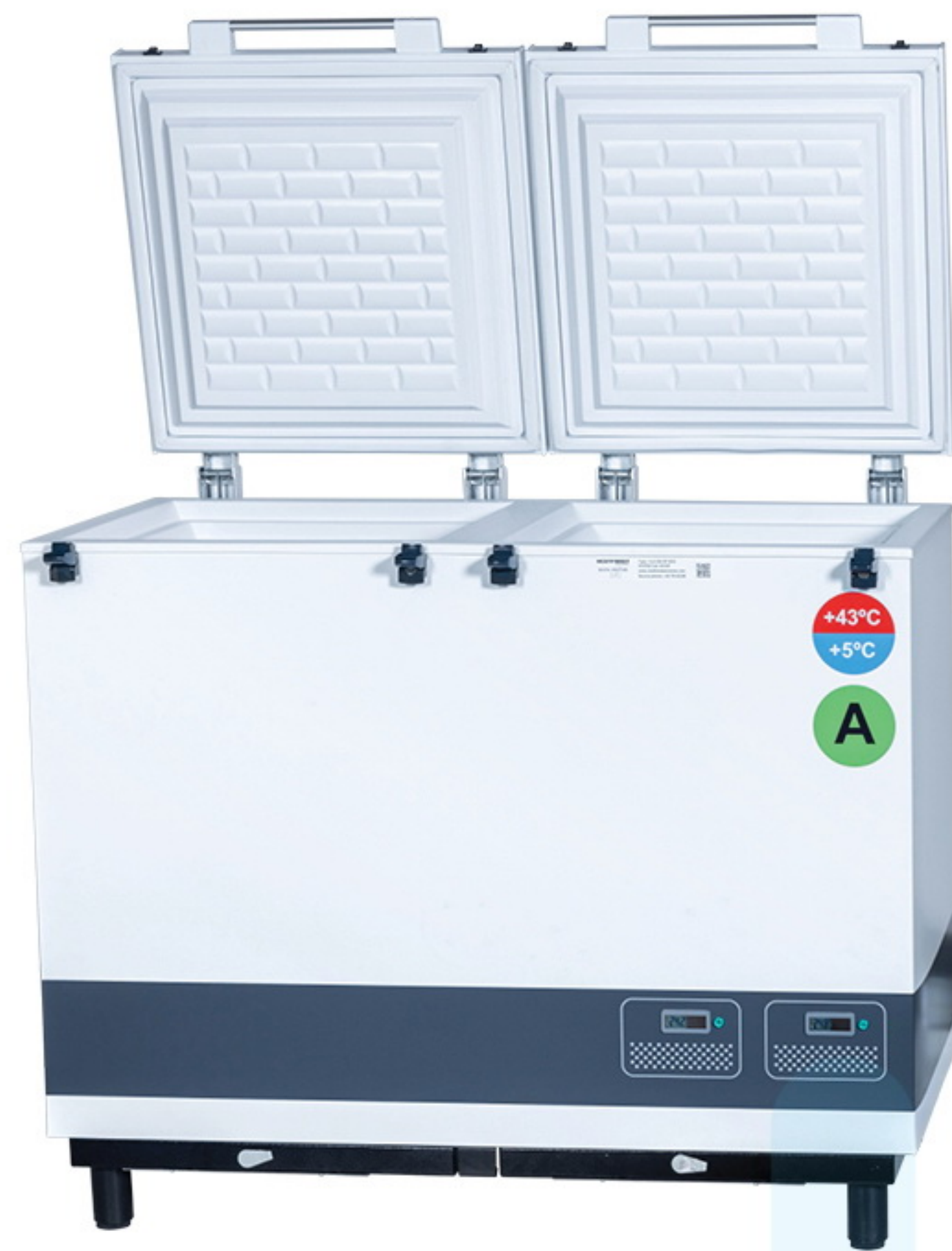
VLS 056 RF SDD