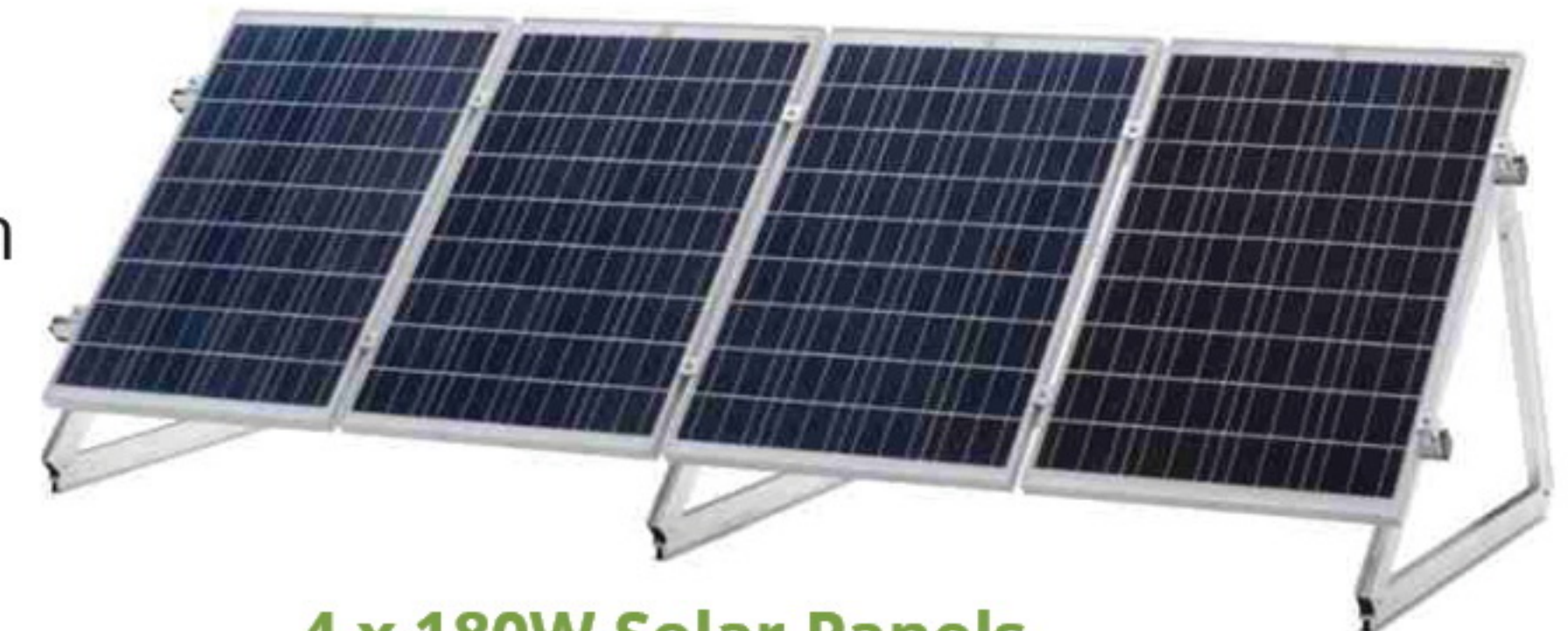
4 x 180W Solar Panels

Temperature range at 43°C AMB Cooler : +2 ~ +8°C Freezer : -14 ~ -16°C